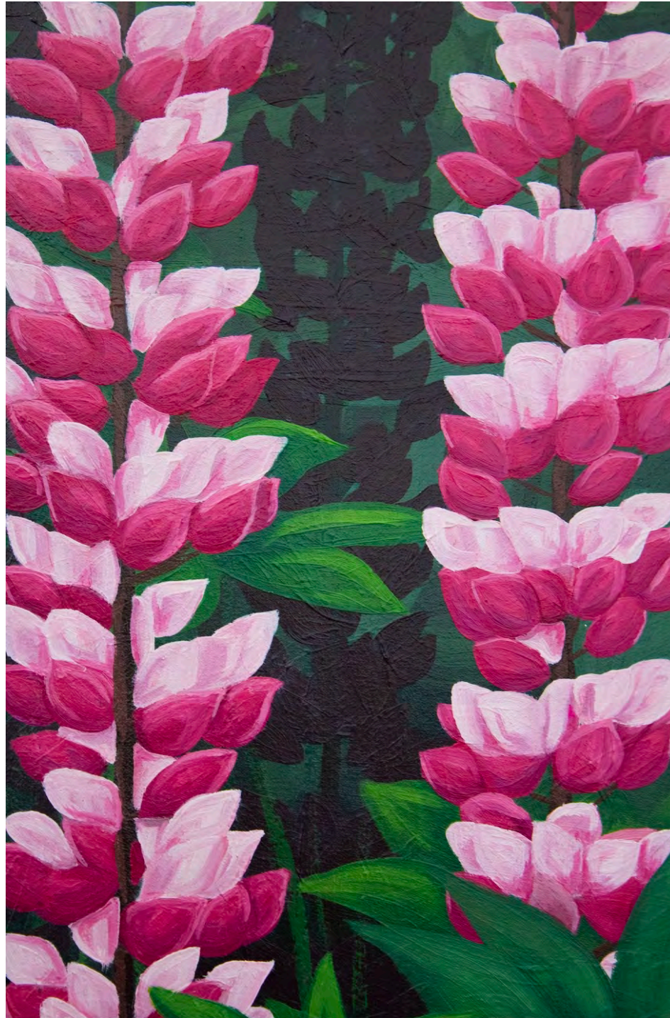
Close up of escape (2023) Showing detail of the lupins on the left- hand side of the painting