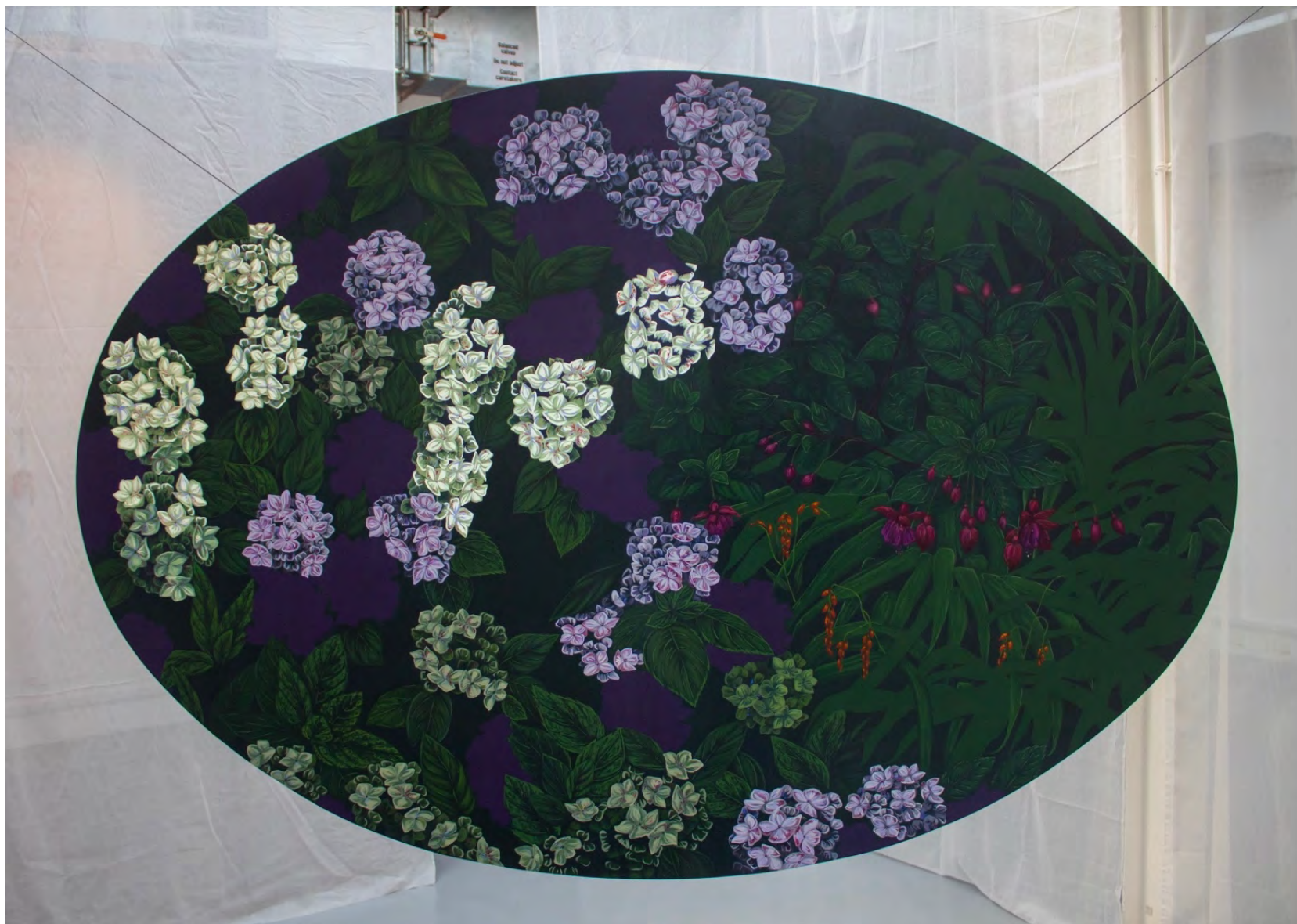
Home (2023) Oil on canvas 192 x 133cm