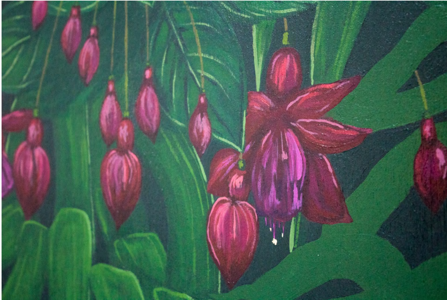
Close up of Home (2023) Showing details of the fuchsias on the right-hand side of the painting