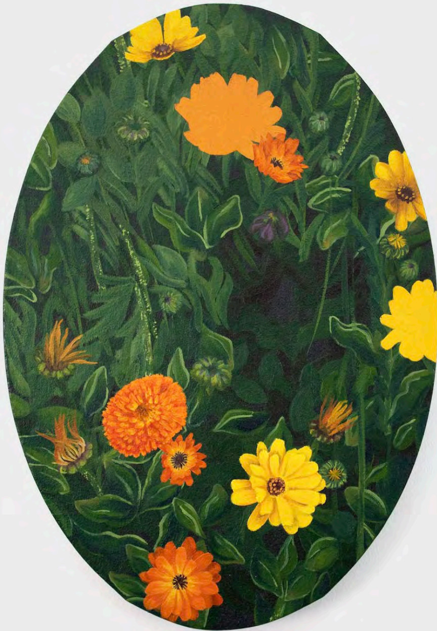
alive (2023) Acrylic and oil on canvas 25.7 x 37cm