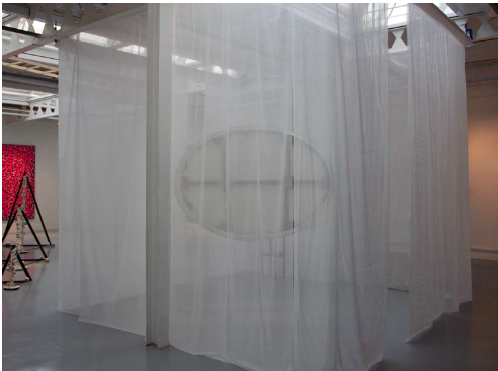
Left: Back view of the enclosed curtain structure within Safety Net (2023) installation