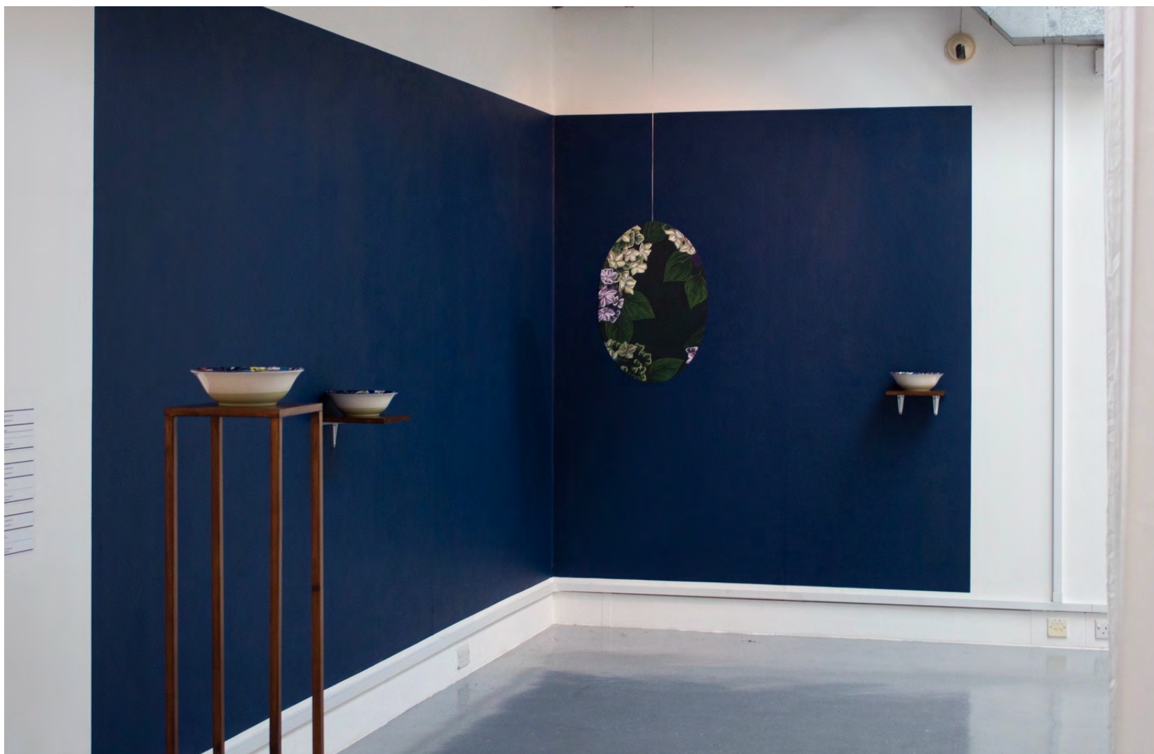
Safety Net (2023) (painted corner component) Showing three of the readymade ceramic bowls and Macro (2023) Displayed in the Herbert Read Gallery at University for the Creative Arts, Canterbury