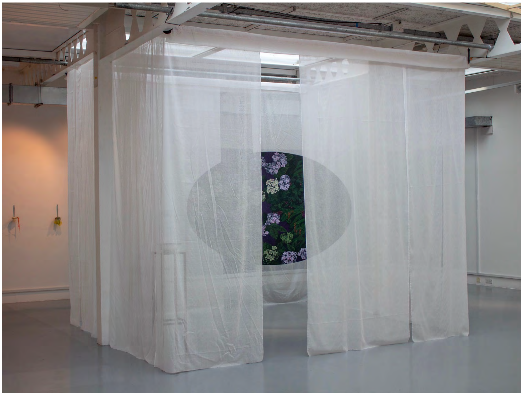
Front view of Safety Net (2023) (enclosed curtain component) An installation comprising of two paintings on canvas and four readymade bowls Displayed in the Herbert Read Gallery at University for the Creative Arts, Canterbury