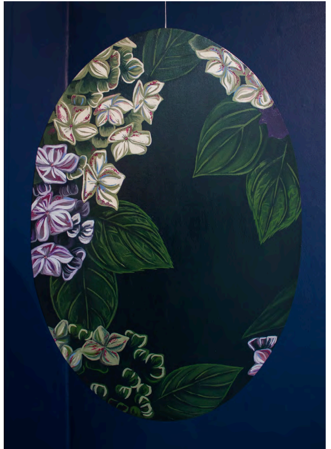
Macro (2023) Oil on canvas 71.5 x 48.5cm