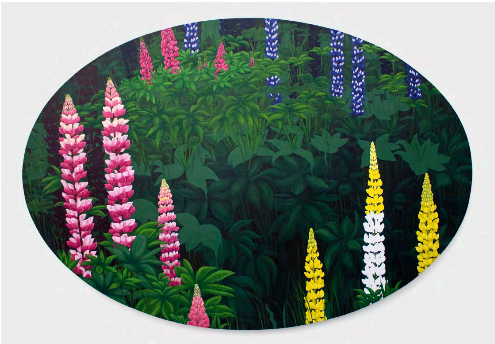
escape (2023) Acrylic and oil on canvas 88 x 128cm